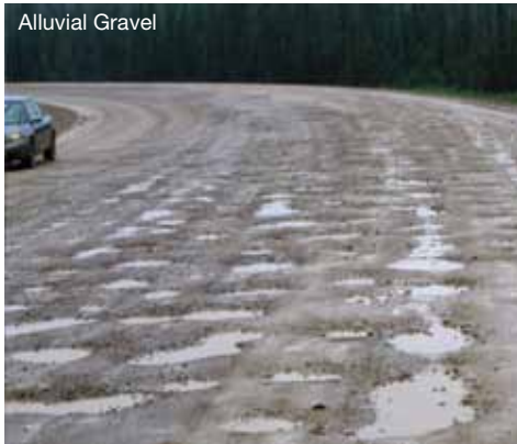
Road Construction: Alluvial (round) gravel Year Constructed: 2007 Date of Photograph: August 13, 2008

The photos below depict a portion of Canterra Road that was constructed in 2007 using alluvial gravel, and another portion of the same road constructed using Hammerstone crushed limestone two years earlier. The photographs of the road were taken immediately following a three hour rainstorm on August 13, 2008.