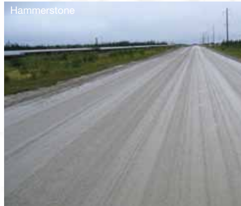
Road Construction: Hammerstone (crushed limestone) Year Constructed: 2005 Date of Photograph: August 13, 2008